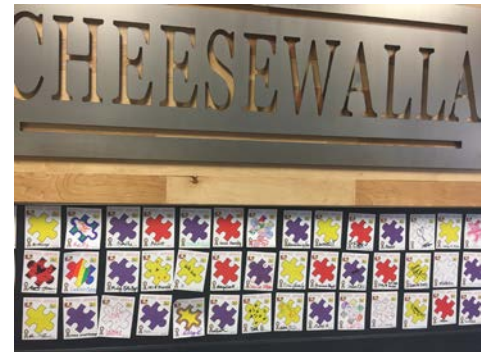
Coloring for the Future of Autism

IMPACT AND COMMUNITY FEEDBACK - The community feedback we receive via emails, phone calls or at events is antedotal, thanking us for the programming on television and radio.