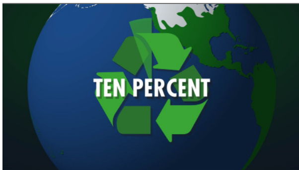
Created to highlight Earth Day. Taking inspiration from this year’s theme of “End Plastice Polluntion’ from earthday.org.