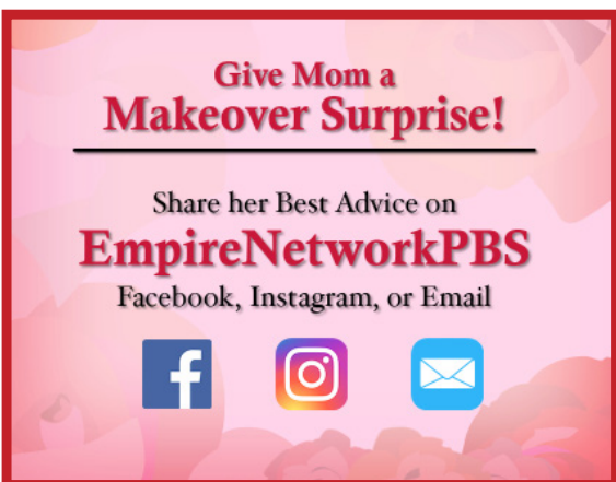
Mother’s Day Contest: In May social media pushed a Mother’s Day contest that ran in conjunction with our special Mother’s Day spots. We asked viewers to share the best advice their mother ever gave them, for a chance to win a complimentary makeover from Cre Hair Salon in Highland.