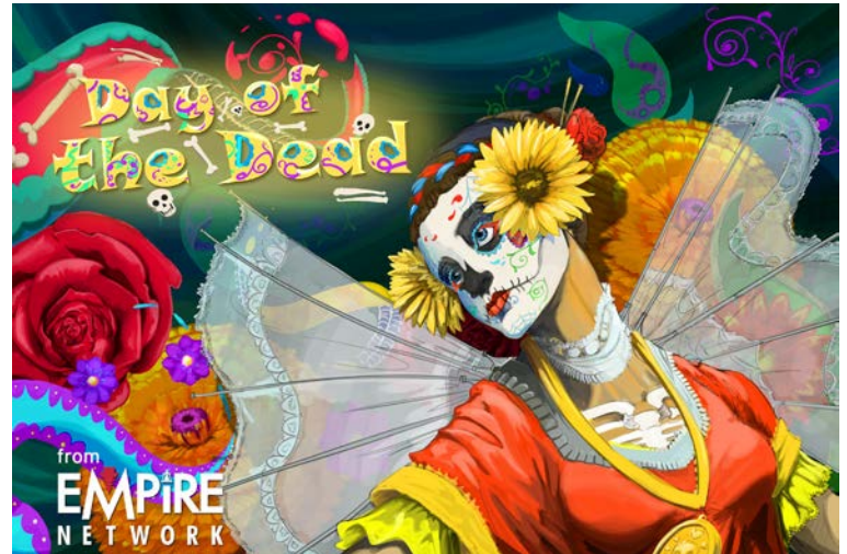
Created and shared on social media were graphic images of Dia de Los Muertos