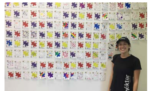
Coloring for the Future of Autism