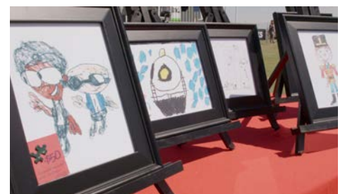
Autism Art Garden